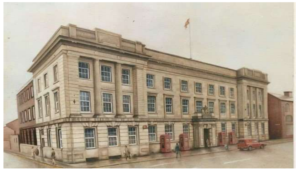
Oil painting by Bolton Artist, David Yates

This month's photograph is of an oil painting of the old General Post Office on Deansgate (1995). The Post Office was closed on 14 August 2018. In 2020 it was transformed into 48 flats.